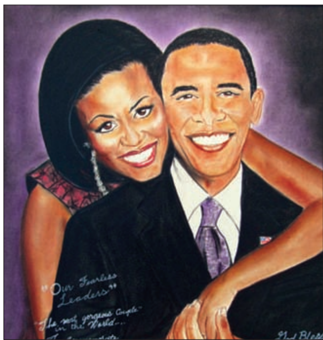
President Obama and the First Lady, 2010, acrylic, 40 x 60".