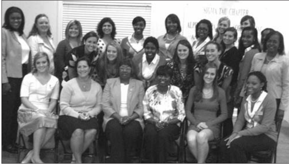
Sigma Tau Chapter members with guests at Breast Cancer Tea

The Sigma Tau Chapter of Alpha Kappa Alpha Sorority, Incorporated at Armstrong Atlantic State University, supported Breast Cancer Awareness Month with a Breast Cancer Tea held at the Compass Point Clubhouse on October 26, 2009.