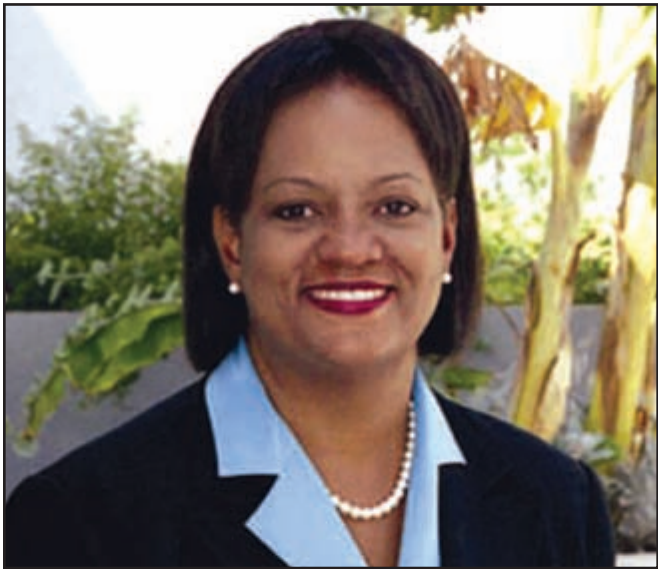
Dr. Regina Benjamin

The Senate has confirmed Dr. Regina Benjamin to be the U.S. surgeon general.