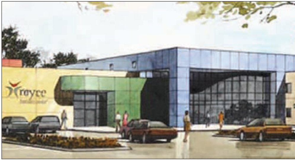
Rendering of New Royce Learning Center Facility

Royce Learning Center will hold a re-dedication breakfast at 9 a.m. on October 29th, 2009 to celebrate the completion of renovations to their building at 4 Oglethorpe Professional Blvd. The ceremony will include performances by Chatham Academy students and a ribbon cutting.