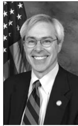
Congressman John Barrow Budget Office has cited unemployment benefits as one of the most cost-effective forms of economic stimulus. Every dollar spent on unemployment benefits generates $1.63 in new demand, according to Moody's chief economist

The extension will provide immediate, effective stimulus to the local economy. The Congressional