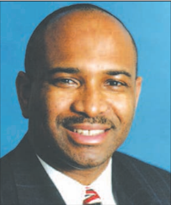
Senator Lester Jackson

State Sen. Lester Jackson (D-Savannah) has been named as an at-large member of the Democratic National Committee (DNC). He becomes one of only eight Georgians and the only member of the Georgia General