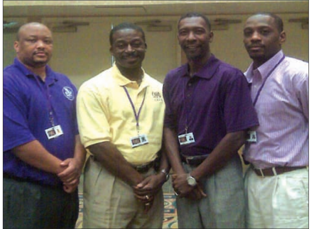
Mu Phi Chapter members, Omega Psi Phi Fraternity, Inc. pose for a picture during Leadership training in Las Vegas, Nevada.

Local members of Mu Phi Chapter of Omega Psi Phi Fraternity, Incorporated recently attended National Leadership Training on July 22-25 in Las Vegas, Nevada.