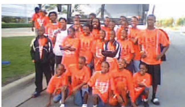
Members of the Savannah-Chatham Silver Cheetahs

Join the Savannah-Chatham Silver Cheetahs for the 2009 Outdoor Developmental Track & Field Season.