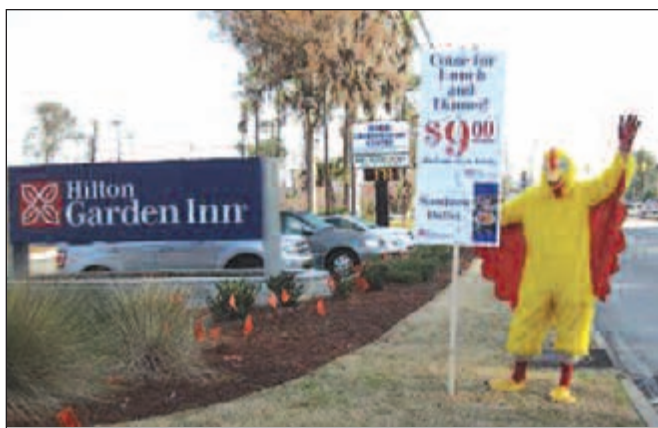
Hilton Garden Inn promotes Southern Buffet

During these tentative times, a great deal is very important to the consumer. A variety of businesses are looking for creative ways to drive business.