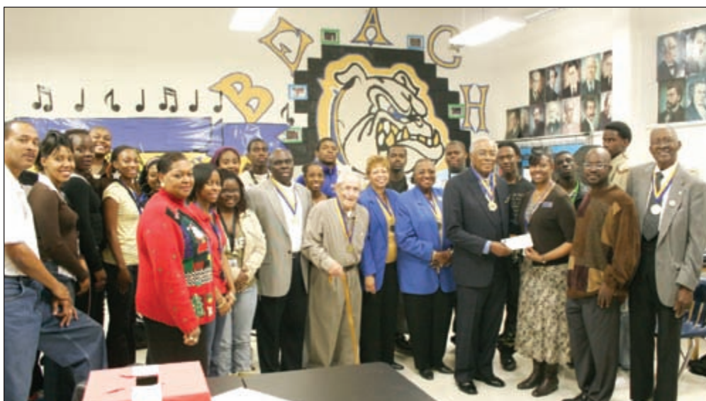
Beach High School's administrators, staff and students accept a very generous gift from representatives of the Beach Cuyler Neighborhood Association.

On Friday, December 19, the Beach Cuyler Neighborhood Association surprised the students of A.E. Beach High School with a $15,000 check to help pay for their trip to Washington DC to witness the inauguration of President-elect Barack Obama.