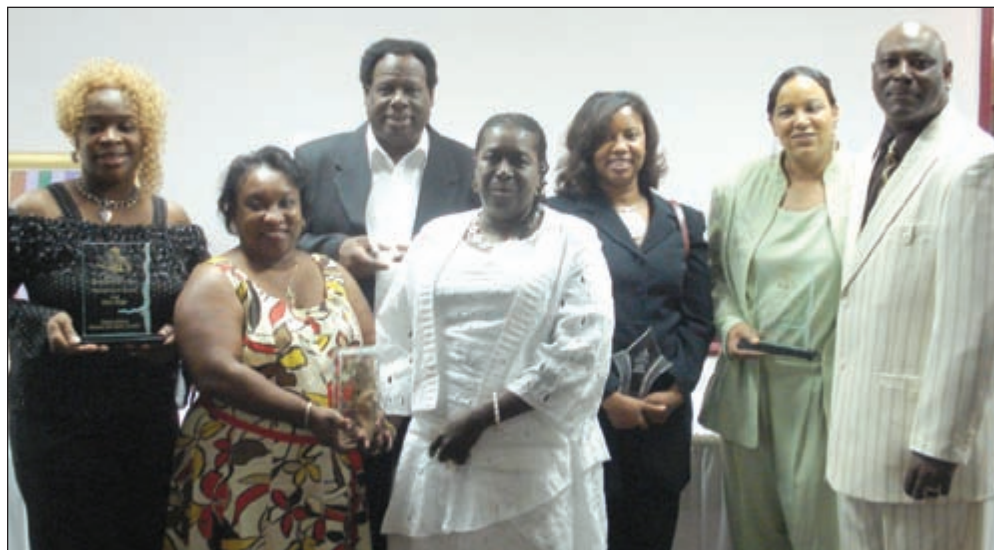
Employees of DreamMakers Contractors & Consultants firm accept award.