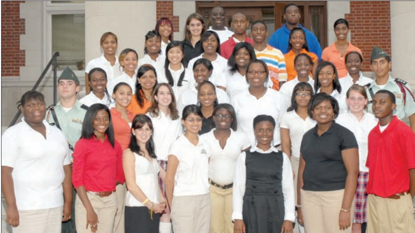
2008-2009 Chatham County Youth Commissioners