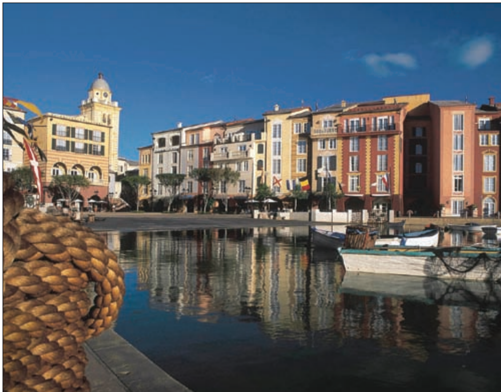
Staying at the Loews Portofino Bay Hotel is a fantastic way to experience Orlando.

Blockbuster Entertainment, Great Value and Convenience at Universal's On-site Loews Hotels and Theme Parks will Thrill Guests All Summer Long