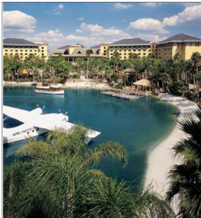
Loews Royal Pacific Resort at Universal Orlando.

Situated on a dramatic 53-acre site, this world-class