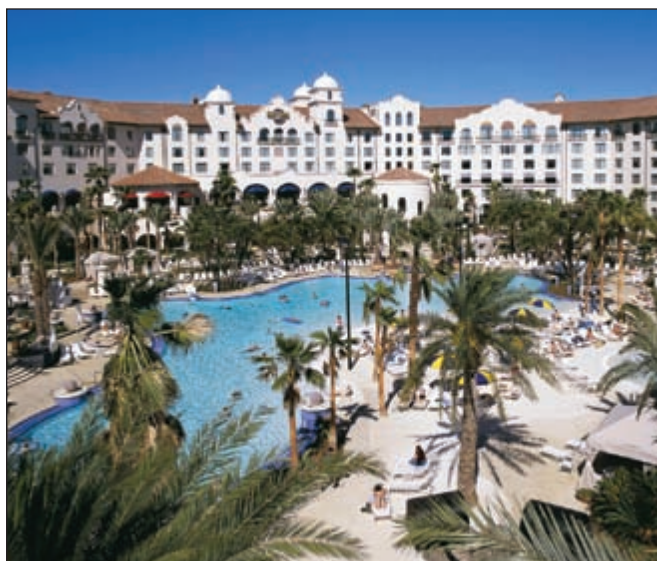
Fun, Fun, Fun at the Hard Rock Hotel

resort captivates guests with its unique design, exotic charm, elaborate landscaping, waterfalls and lagoons.