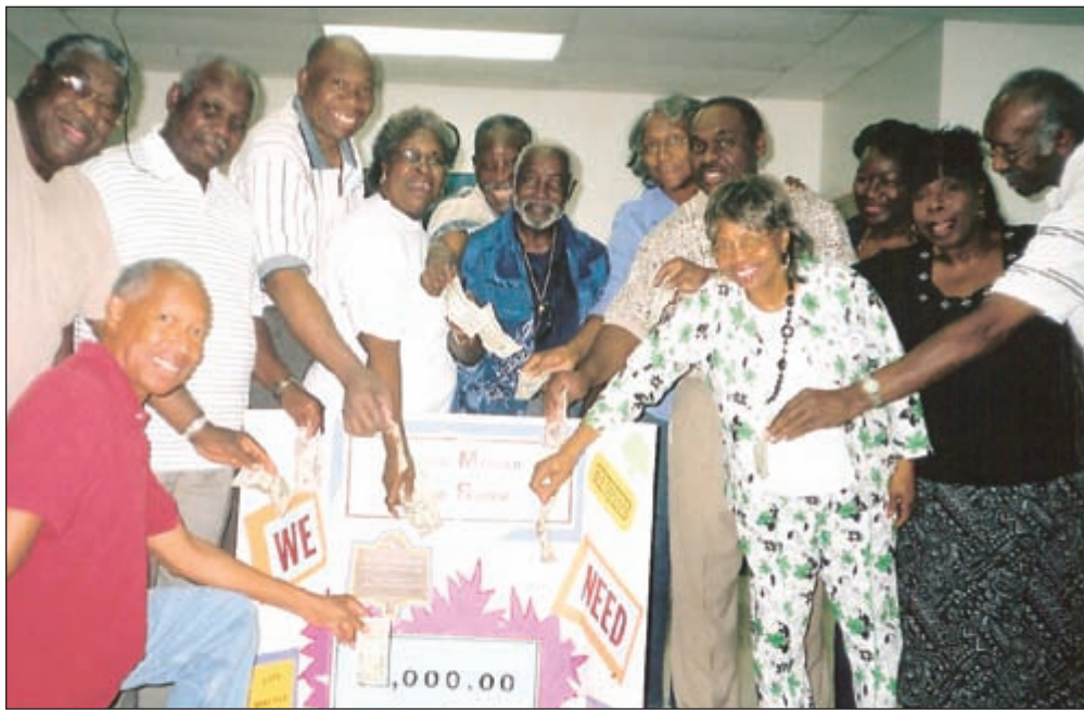
Members of Haven Home School Alumni Association

The Haven Home School Alumni Association held its monthly meeting on Thursday July 2, 2008, 7:00 pm at the Crusader Community Center 81 Coffee Bluff Villa Road. The alumni held a successful Annual Low Country and Soul Food Picnic on June 21, 2008 at the center.