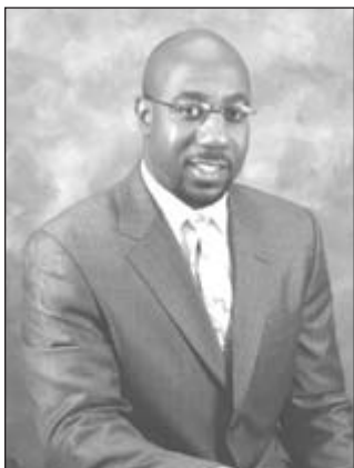
Rev. Dr. Raphael Warnock.

The speaker will be Rev. Dr. Raphael Warnock. He serves as the Senior Pastor of Ebenezer Baptist Church, the spiritual home of the Rev. Dr. Martin Luther King, Jr. Rev. Warnock graduated from Morehouse College cum laude in 1991, receiving a B.A. degree in psy-